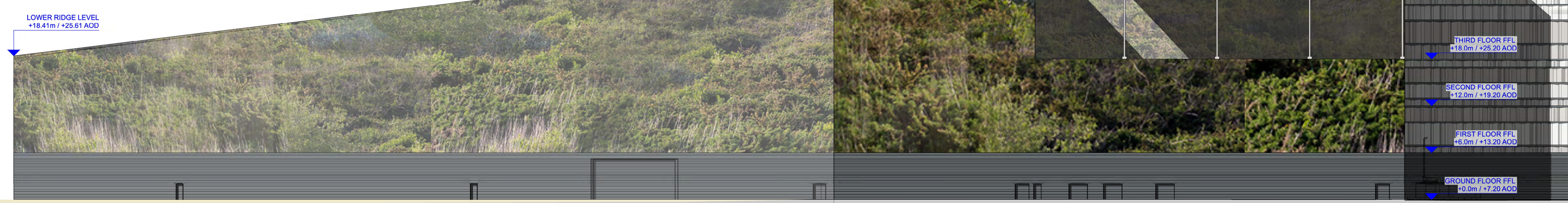
01 Elevation 01 (north-eastern) 1:250 @ A1 / 1:500 @ A3